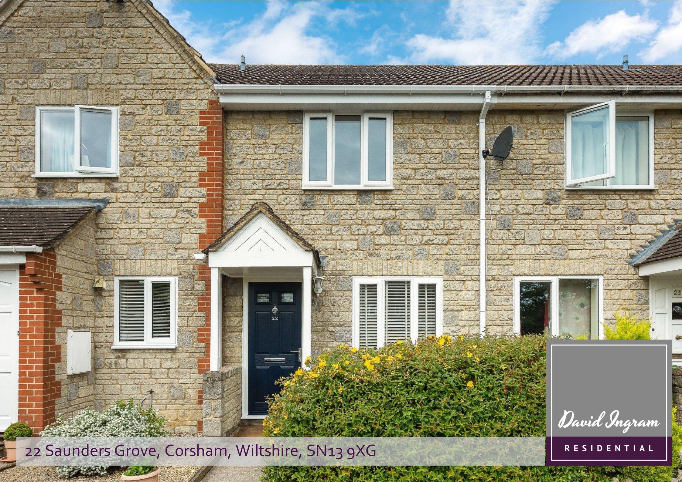
22 Saunders Grove, Corsham, Wiltshire, SN13 9XG