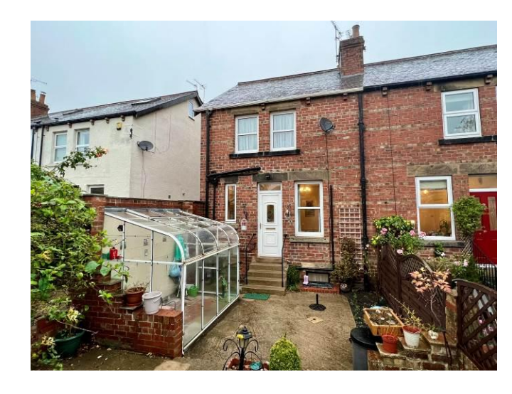
Details prepared Octoberr 2022

By appointment with the Chartered Surveyors Renton & Parr at their offices, Market Place, Wetherby. Telephone (01937)582731