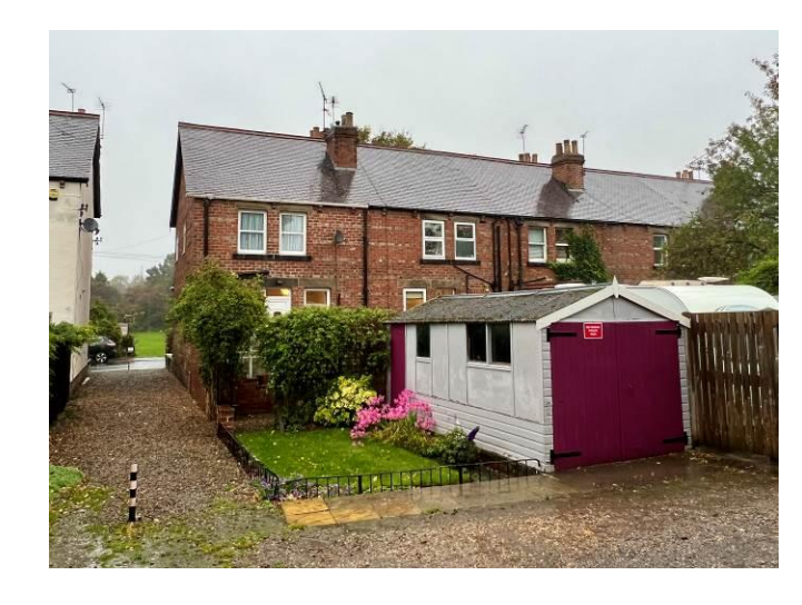
COUNCILTAX Band C (from internet enquiry).

Decorative front garden of low maintenance bushes and shrubs with gravel infill behind Dwarf garden wall, stone steps leading to front door under little porch portico. Gravel path leading to side of the property provides access to rear garden, south facing patio rear garden behind brick garden wall and timber fence to opposing side complete with glass greenhouse provides ideal space for outdoor entertaining, barbecue and 'al-fresco' dining in the summer months. A lawned cottage style garden to the rear next to single garage set mainly to lawn bordered with flowering bushes and shrubs and climbing plants.