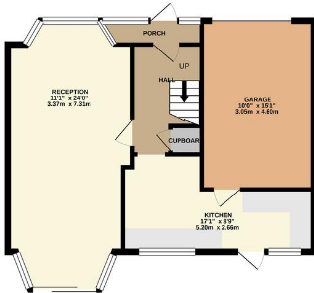
GROUND FLOOR 585 sq.ft. (54.3 sq.m.) approx.