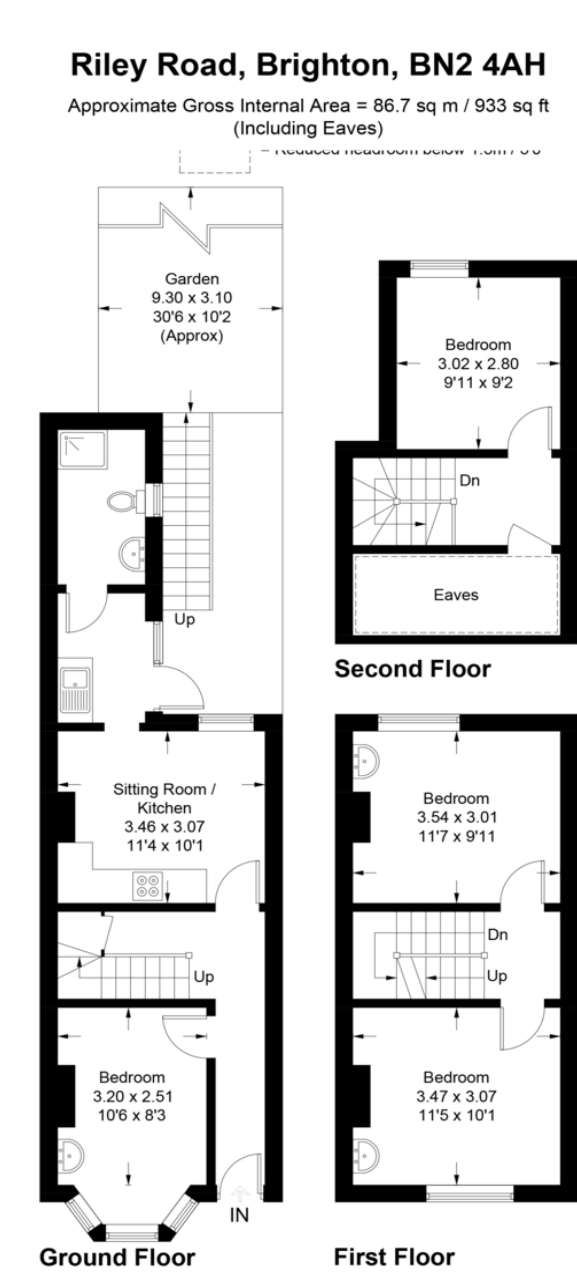
Illustration for identification purposes only, measurements are approximate, not to scale. Imageplansurveys @ 2024

Why not take a short stroll into town and really soak up Brighton & Hove's cosmopolitan atmosphere by exploring around the wide range of bars, restaurants and shops on offer. This City really is known for its entertainment and lifestyle.