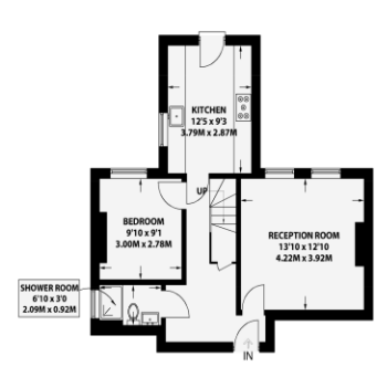
First Floor 547 sq ft / 50.8 sq m