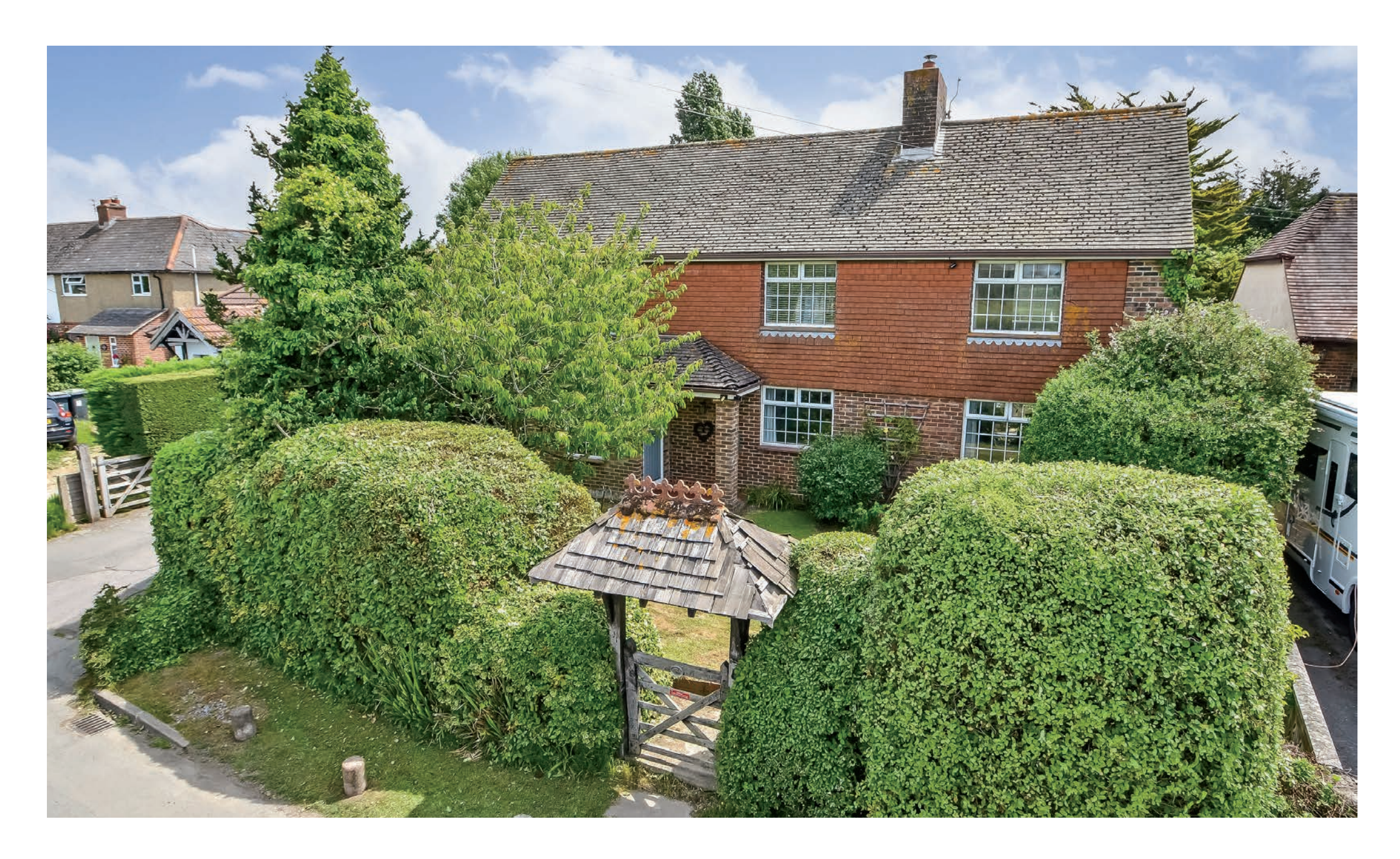
Northfork 8 Castlemans Lane | Hayling Island | Hampshire | PO11 0PZ