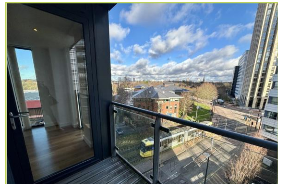
FIFTH FLOOR 460 sq.ft. (42.7 sq.m.) approx.