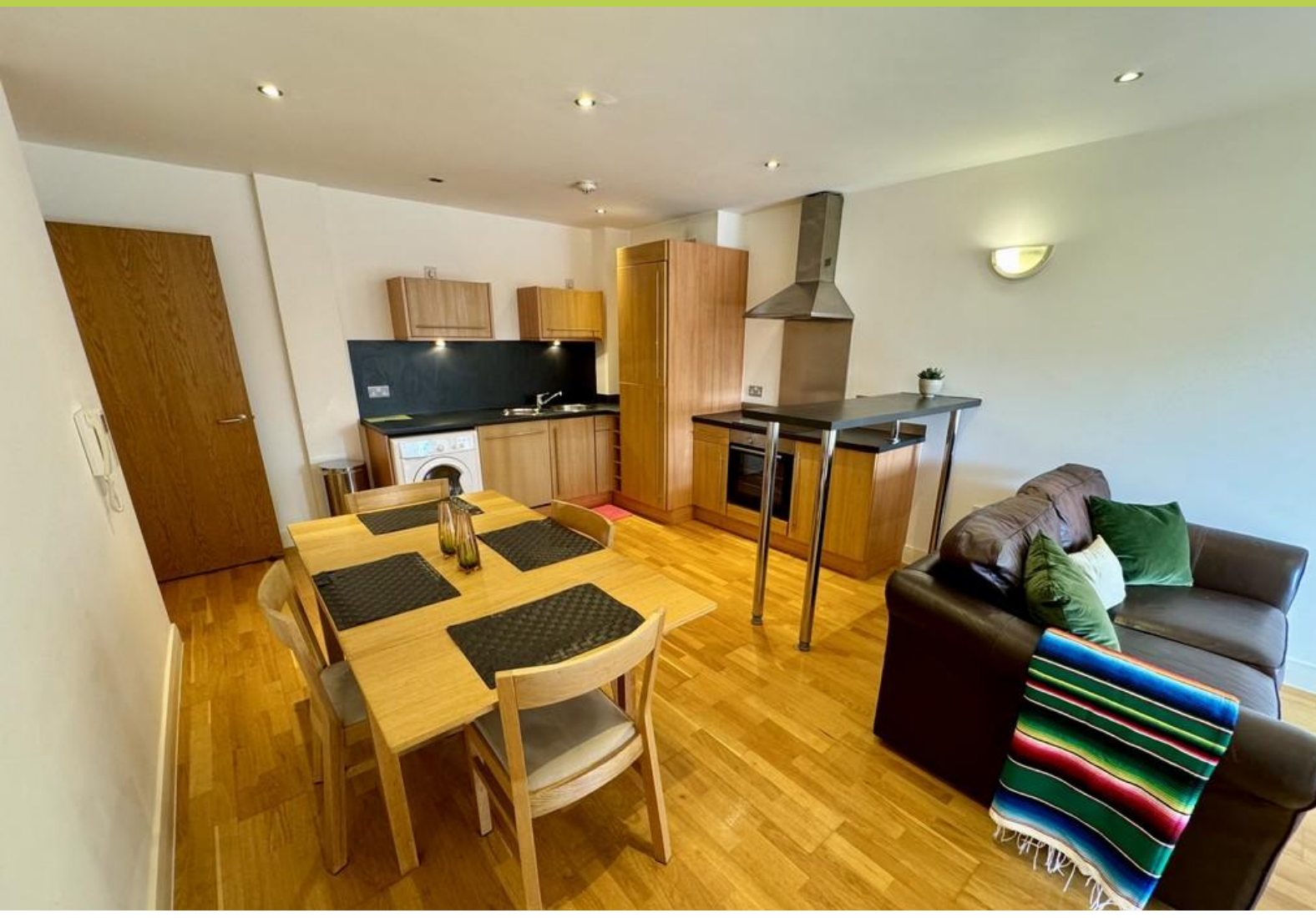
Brook House, 62 Ellesmere Street, M15 4QS - Offers Over £195,000

Julie Twist Properties are delighted to bring to the market this two bedroom apartment, located within Brook House, part of the Castlefield Locks development. Positioned on the fourth floor, this property offers a spacious open plan living room / kitchen with access to a Juliette balcony. The kitchen is fully fitted and has integrated appliances and a breakfast bar. Both bedrooms are spacious and have plenty of space for additional furniture. There is also a three-piece bathroom and storage cupboard, both of which are accessed via the hallway.