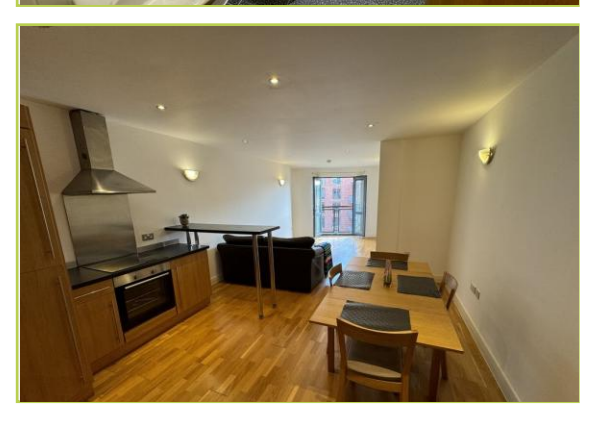
FOURTH FLOOR 836 sq.ft. (77.7 sq.m.) approx.