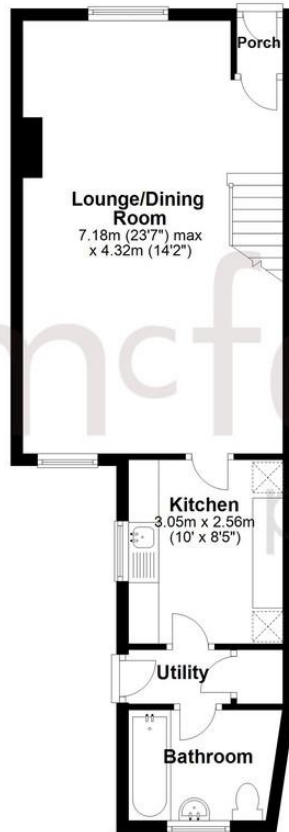
Ground Floor Approx. 46.3 sq. metres (498.7 sq. feet)