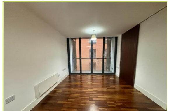
TYPE A 512 sq.ft. (47.5 sq.m.) approx.