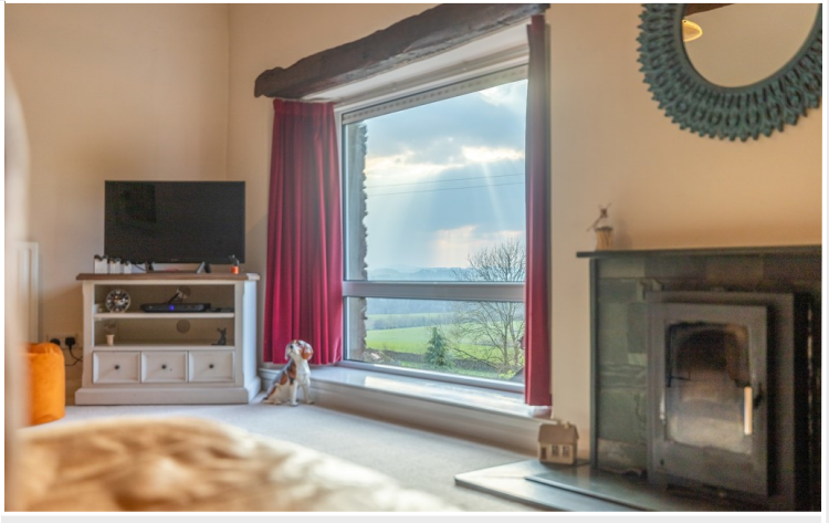
Living Room with a View

Location: The property forms part of the attractive rural hamlet of Garth Row which is about two miles north of the market town of Kendal, just off the A6 Shap Road. Garth Row is surrounded by glorious countryside and is close to the beautiful valley of Longsleddale, which is within the Lake District National Park. There is a highly regarded primary school at nearby Selside and the historic market town of Kendal provides an excellent range of amenities.