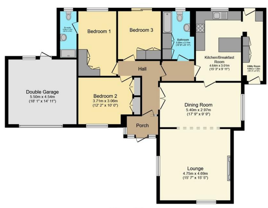
Floor Plan Floor area 137.2 m² (1,476 sq.ft.)

TOTAL: 137.2 m<sup>2</sup> (1,476 sq.ft.)