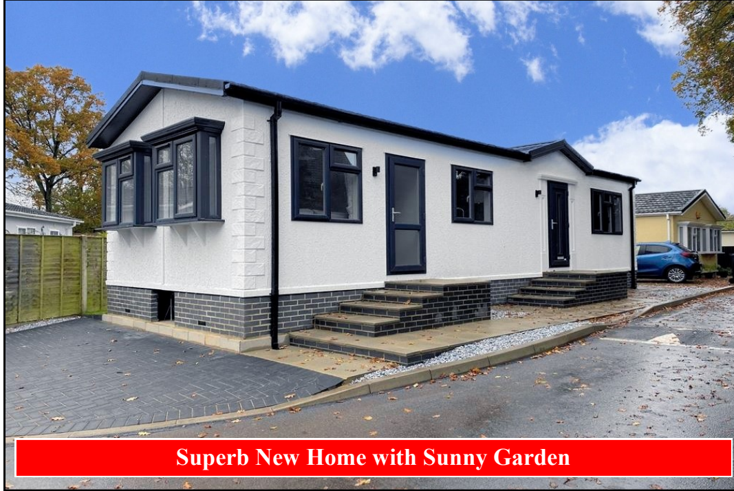
Superb New Home with Sunny Garden

9 Dewlands Park, West Close, Verwood. BH31 6PR