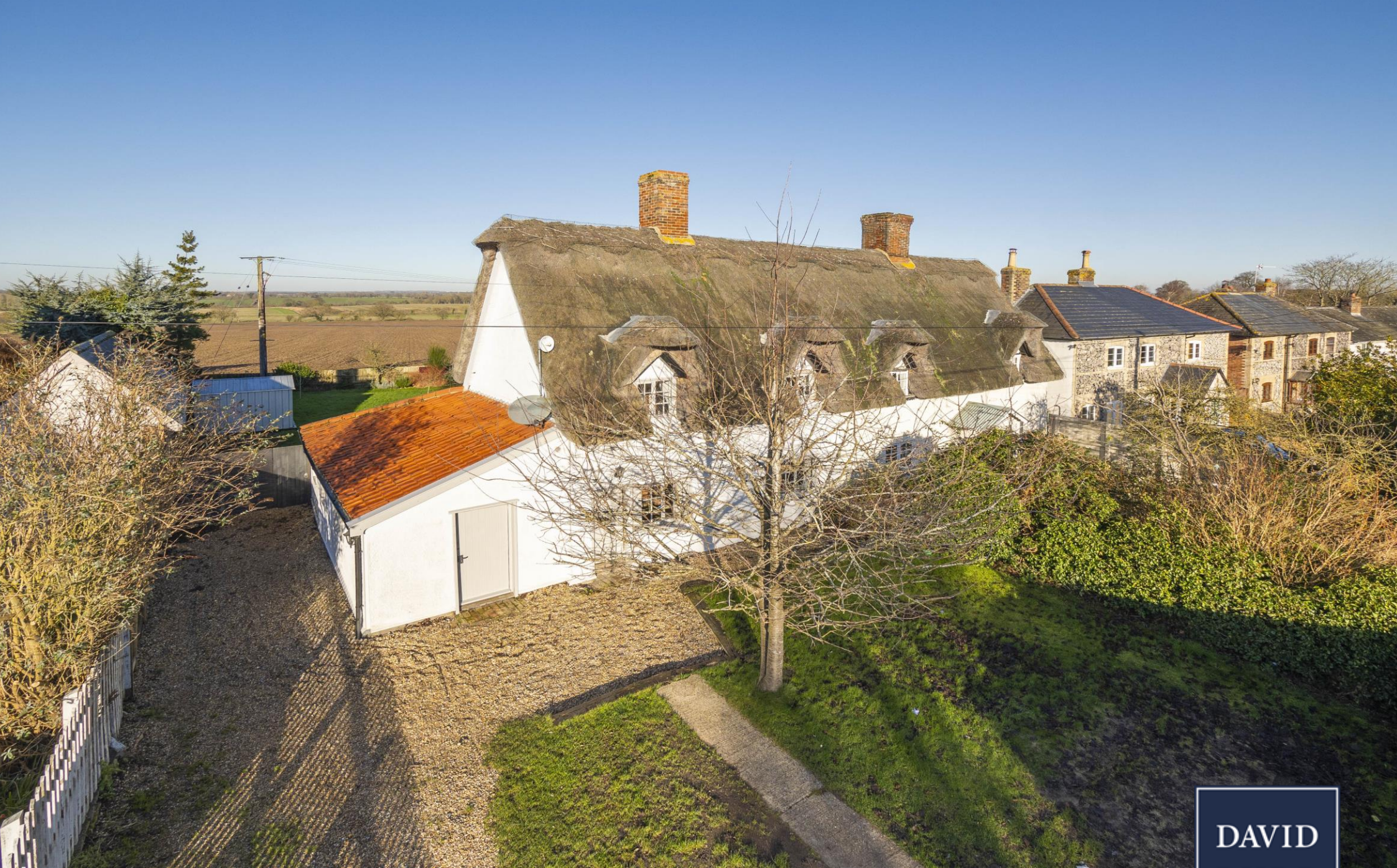
Clematis, Bulmer Street, Bulmer, Suffolk