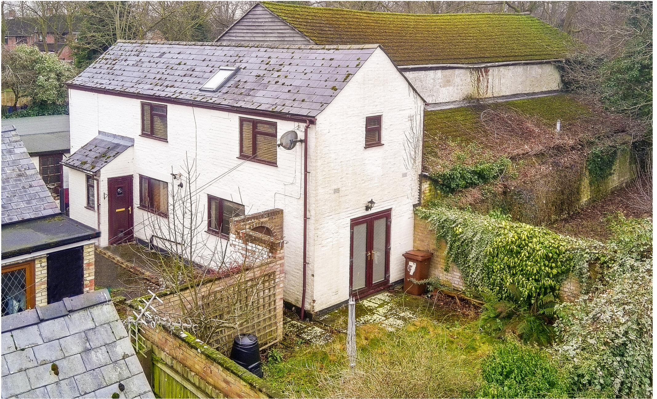
La Grange Place, Exning, Newmarket, Suffolk