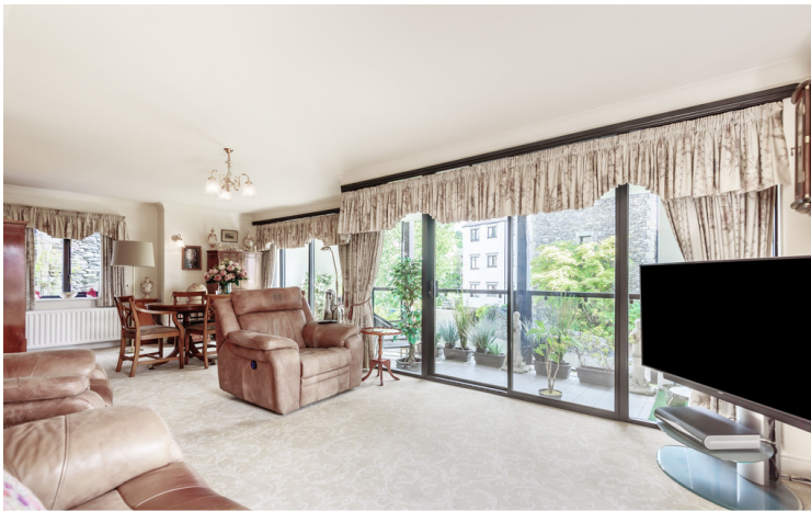
Living / Dining Room