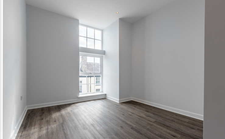
Bedroom 1 with Ensuite

Anti Money Laundering Regulations: Please note that when an offer is accepted on a property, we must follow government legislation and carry out identification checks on all buyers under the Anti-Money Laundering Regulations (AML). We use a specialist third-party company to carry out these checks at a charge of £42.67 (inc. VAT) per individual or £36.19 (incl. vat) per individual, if more than one person is involved in the purchase (provided all individuals pay in one transaction). The charge is non-refundable, and you will be unable to proceed with the purchase of the property until these checks have been completed. In the event the property is being purchased in the name of a company, the charge will be £120 (incl. vat).