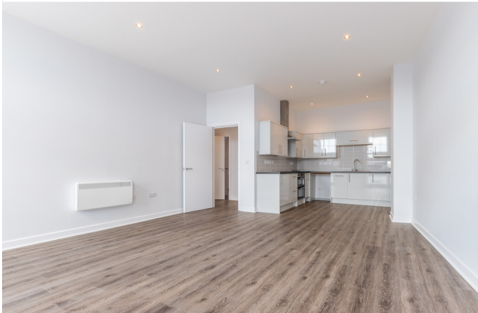
Splendid Open Plan Living Room & Kitchen Area