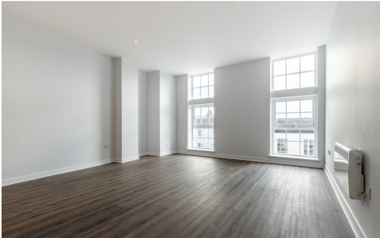
Splendid Open Plan Living Room