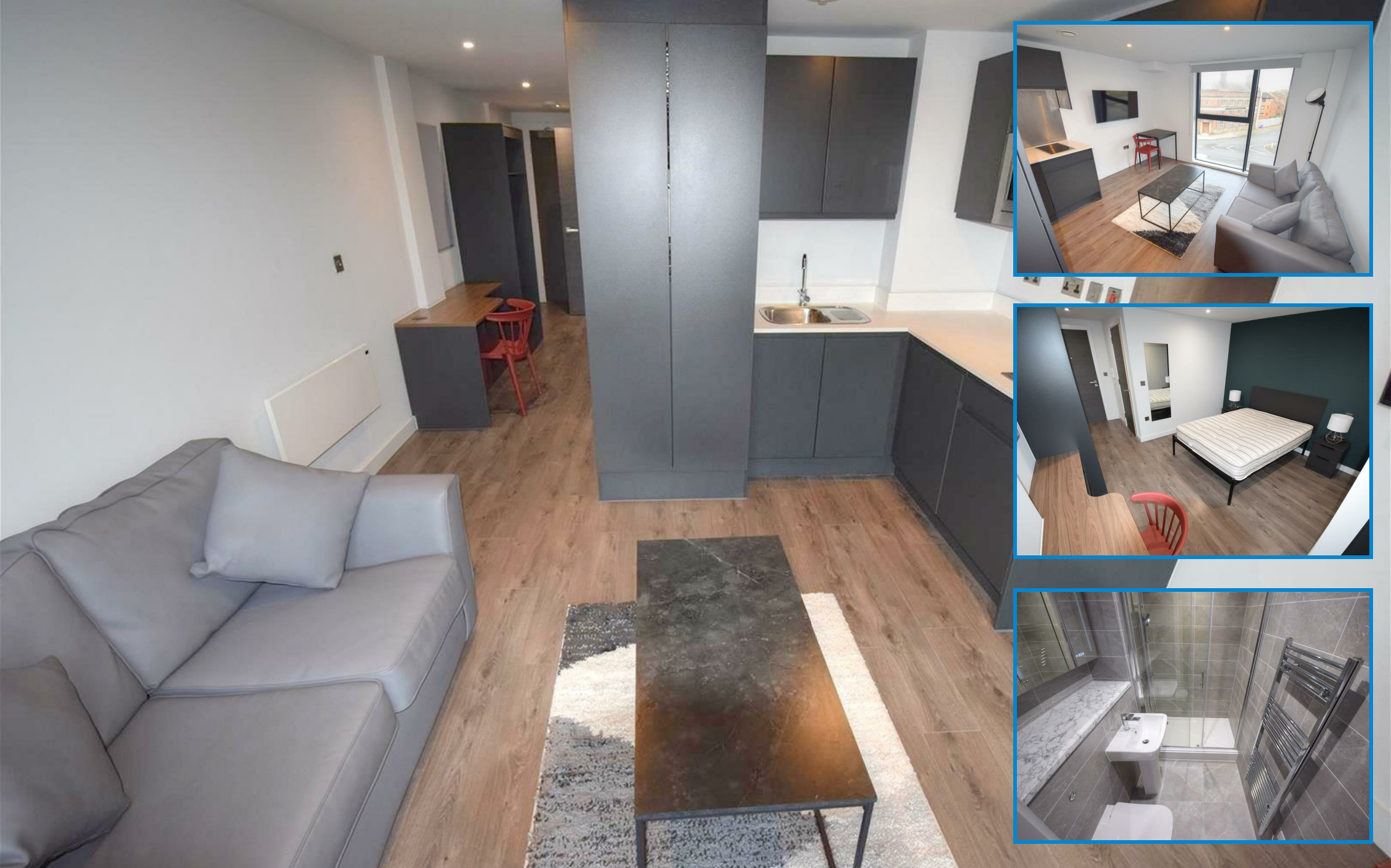
Element - The Quarter 88 Low hill, Liverpool , L6 1AS £100,000