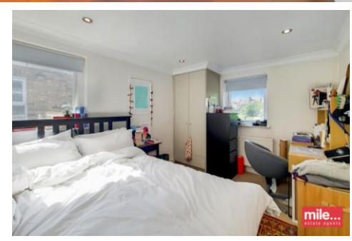
Purves Road, Kensal Green NW10 £2,250 pcm

Mile is delighted to introduce on to the market this superb split-level apartment set on the first and second floor of this Victorian conversion.