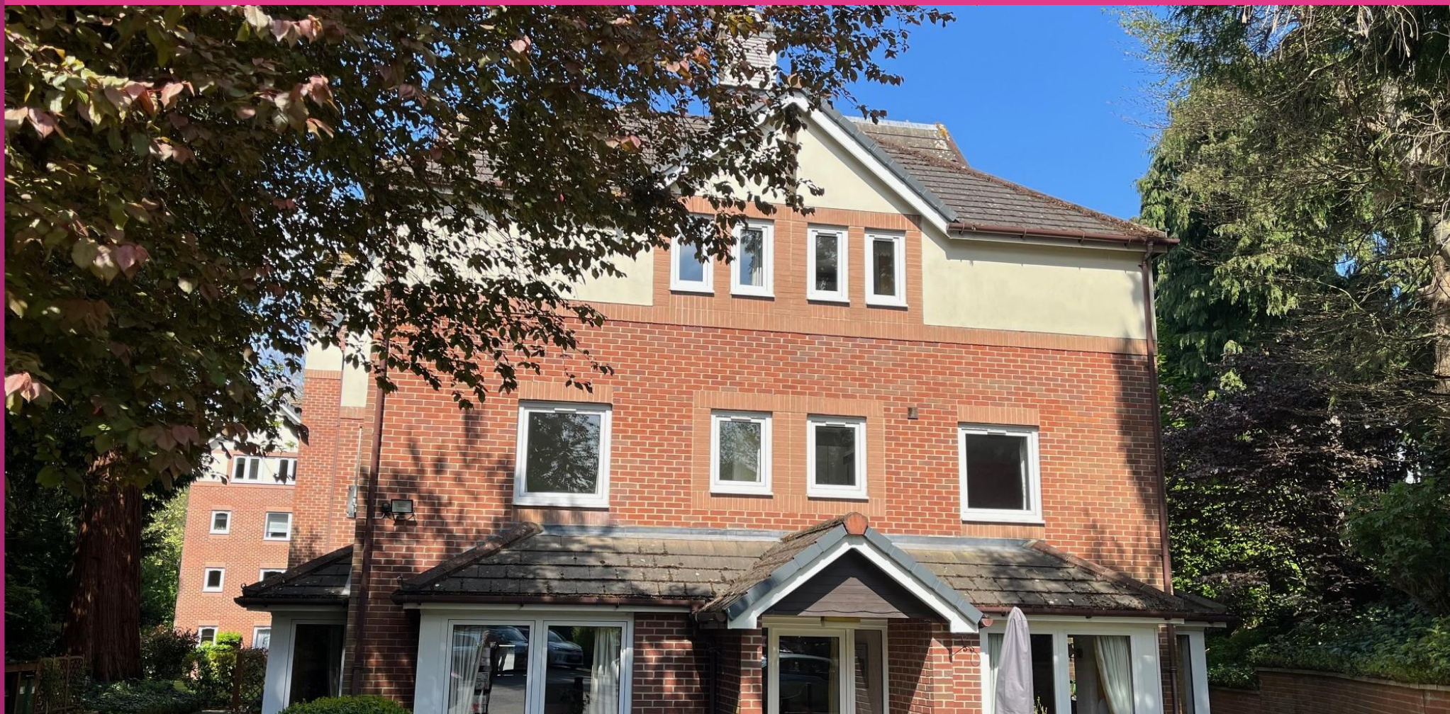
HEATHDENE MANOR, WATFORD - £110,000 1 Bedroom Retirement Home