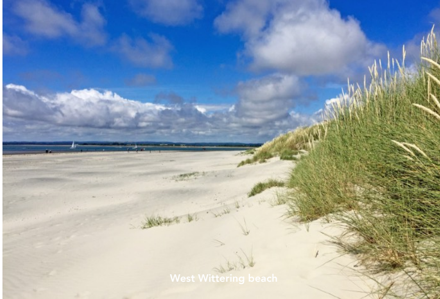
West Wittering beach