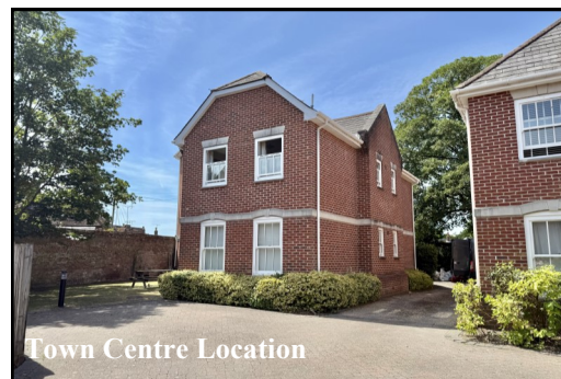
Town Centre Location