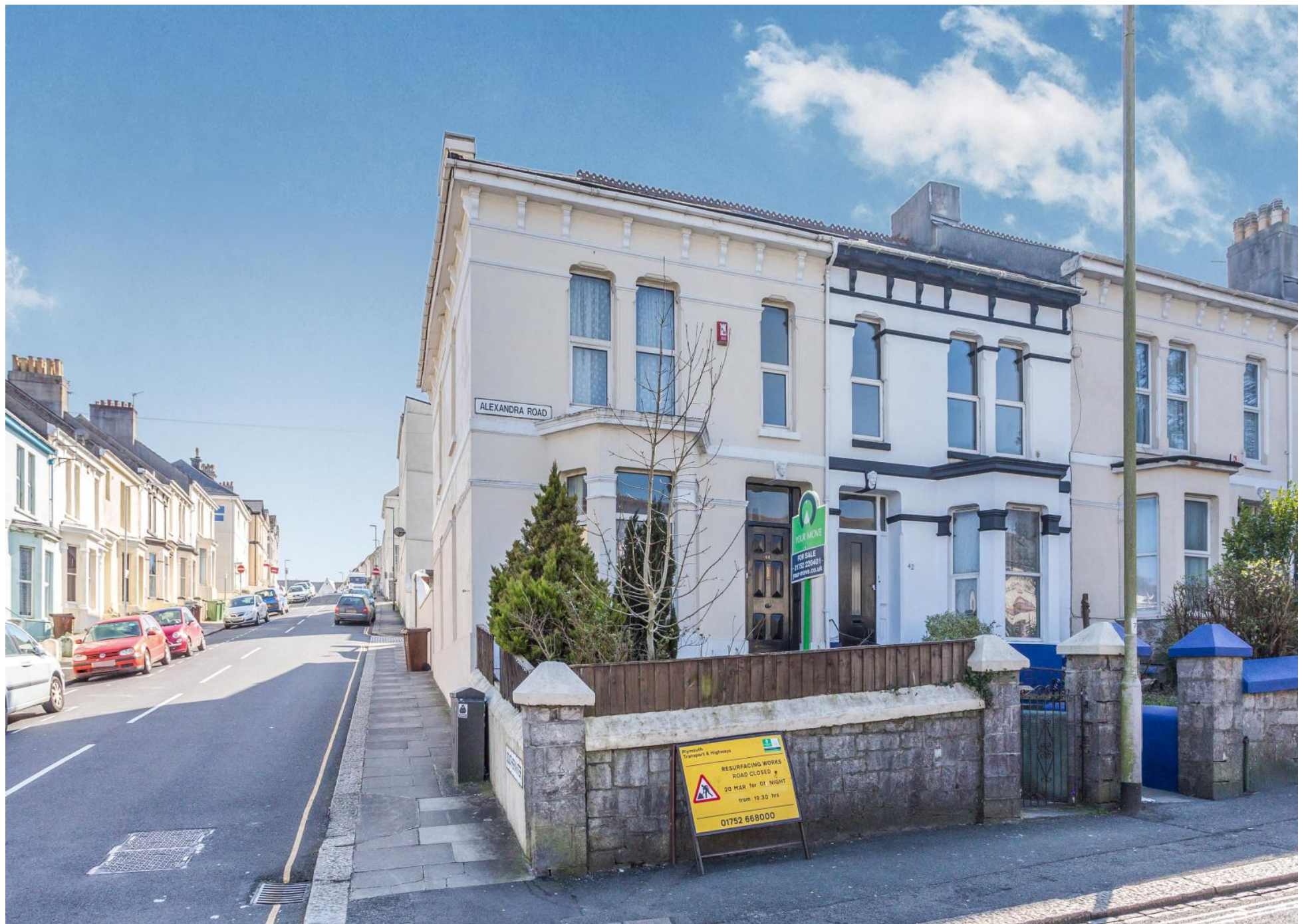
Alexandra Road, Mutley, Plymouth Guide £175,000