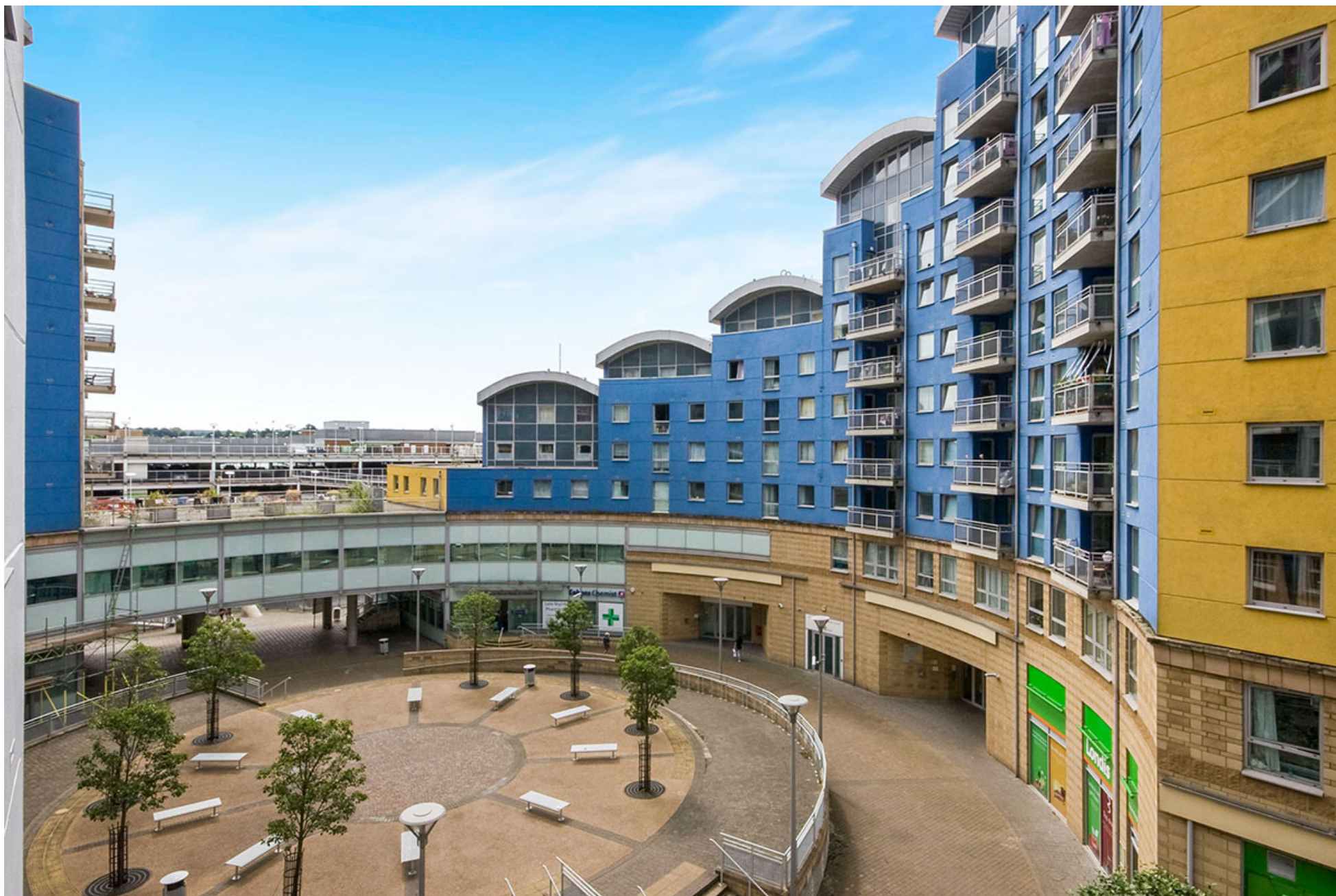
Crown Heights Alencon Link, Basingstoke, Hampshire £200,000