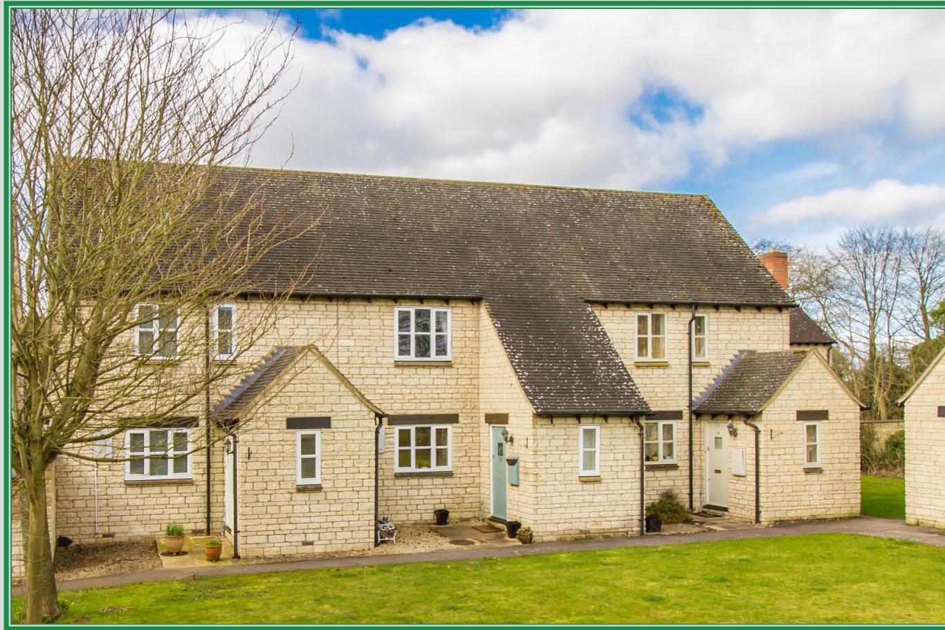
Bradwell Village Oxfordshire