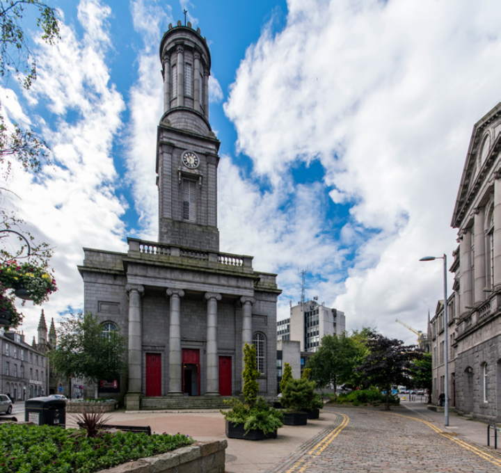
Marischal College Interior, Aberdeen University Kings College, Aberdeen Maritime Museum, Union Square, Castlegate, Aberdeen Harbour and Aberdeen ACT