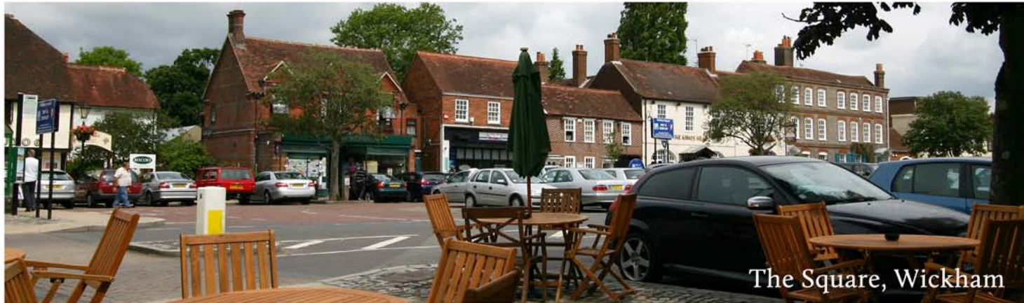
The Square, Wickham