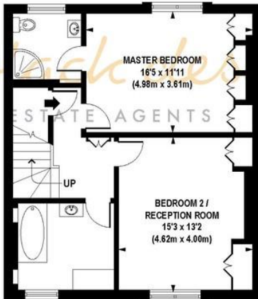
SECOND FLOOR GROSS INTERNAL FLOOR AREA 618 SQ FT

APPROX. GROSS INTERNAL FLOOR AREA 1232 sq. ft / 114.50 sq. m (Including Restricted Height Area & Eaves) APPROX. GROSS INTERNAL FLOOR AREA 844 sq. ft / 78.41 sq. m (Excluding Restricted Height Area & Eaves)