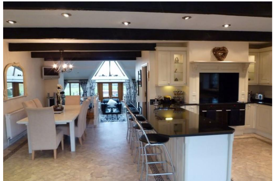
Spring Grange, Carr Lane West Yorkshire, WF13 3NR