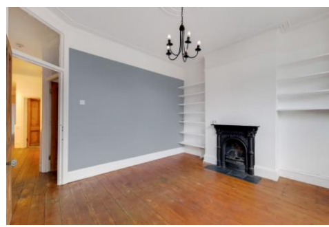
Ancona Road, London NW10 £545,000 Leasehold

Mile are pleased to present to the market this two bedroom garden apartment on this beautiful three lined street. Offered in excellent condition, this beautiful garden apartment provides loving accommodation on this beautiful tree-lined residential road. Well maintained by the current owners, this property takes shape of a great separate reception with bay windows, a great sized master bedroom and further bedroom, a three piece family bathroom and fully fitted eat-in kitchen. There is access via the kitchen onto a beautifully mature garden, ideal for entertaining. Sold with a long lease and chain free. Ancona Road is within easy reach of Kensal Green and Willesden Junction (Bakerloo line and Overground) and Kensal Rise (Overground) stations as well as the numerous coffee shops, restaurants, gastro pubs and shopping amenities of Kensal Rise, Kensal Green, Ladbroke Grove and Notting Hill.