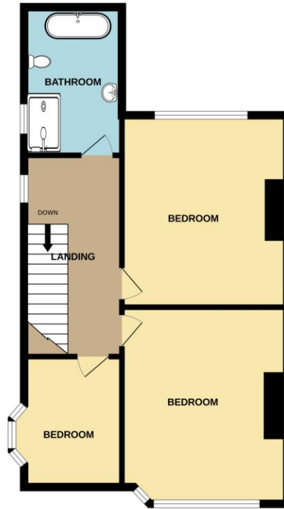
1ST FLOOR 541 sq.ft. (50.2 sq.m.) approx.