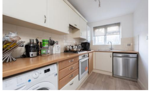
Thornfield Green Camberley, GU17 9EY £300,000