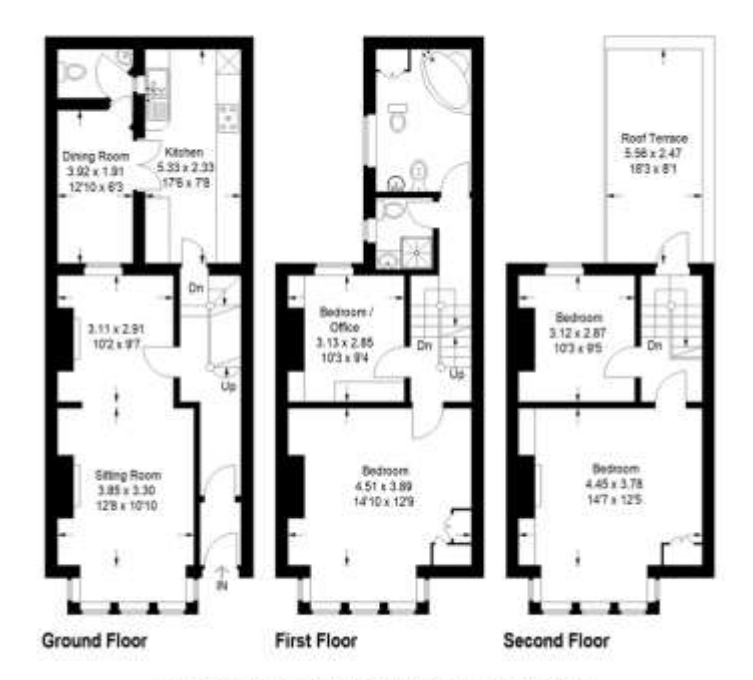
Businston for identification purposes only, measurements are approximate, not to scale. Intagoplansurveys @ 2022