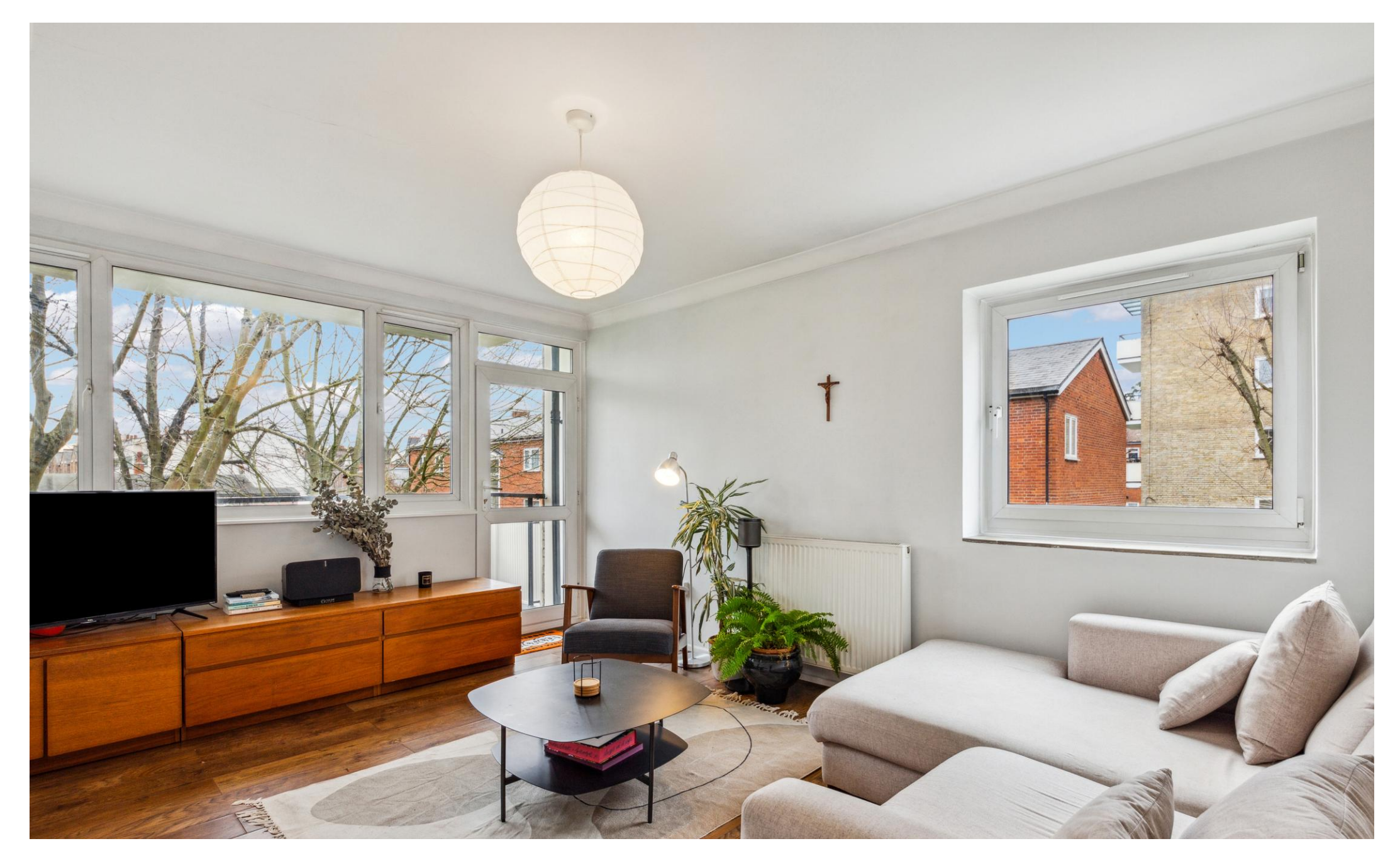
Highbury Quadrant, N5 2TH