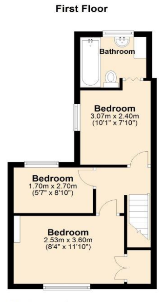
Total area: approx. 67.3 sq. metres (724.0 sq. feet) Hill View , Dingle Lane, Kelsall