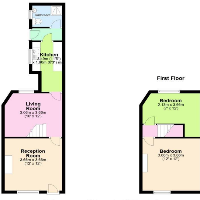
Total area: approx. 60.2 sq. metres (648.2 sq. feet) 125 Hoole Lane, Chester