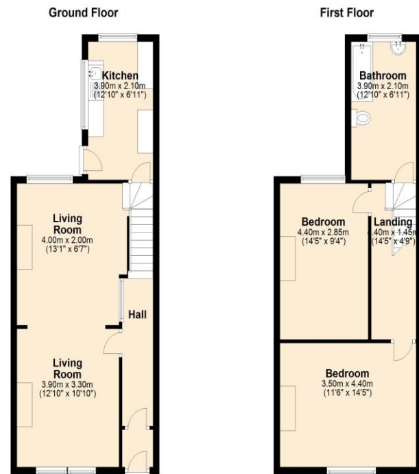
82 Marsh Street, Barrow