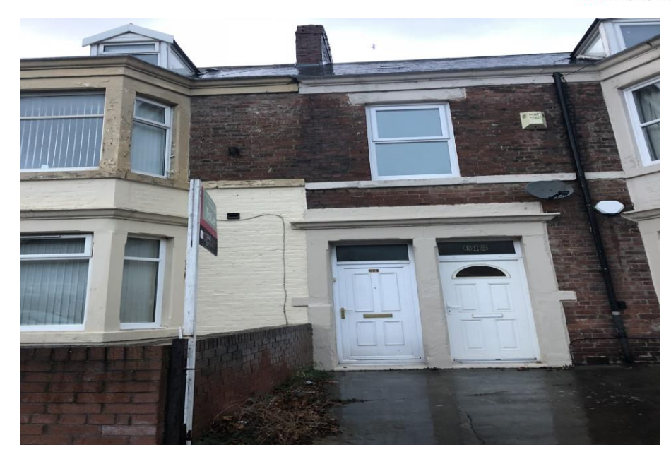
611 Welbeck road, Walker, Newcastle Upon Tyne £ 99,950

David Robson and Associates now welcome to the market this large 3 bedroom maisonette located on Welbeck Road. A perfect opportunity for an investor or first time buyer looking for a project. This property does need some updating however it does have amazing potential to be beautiful.