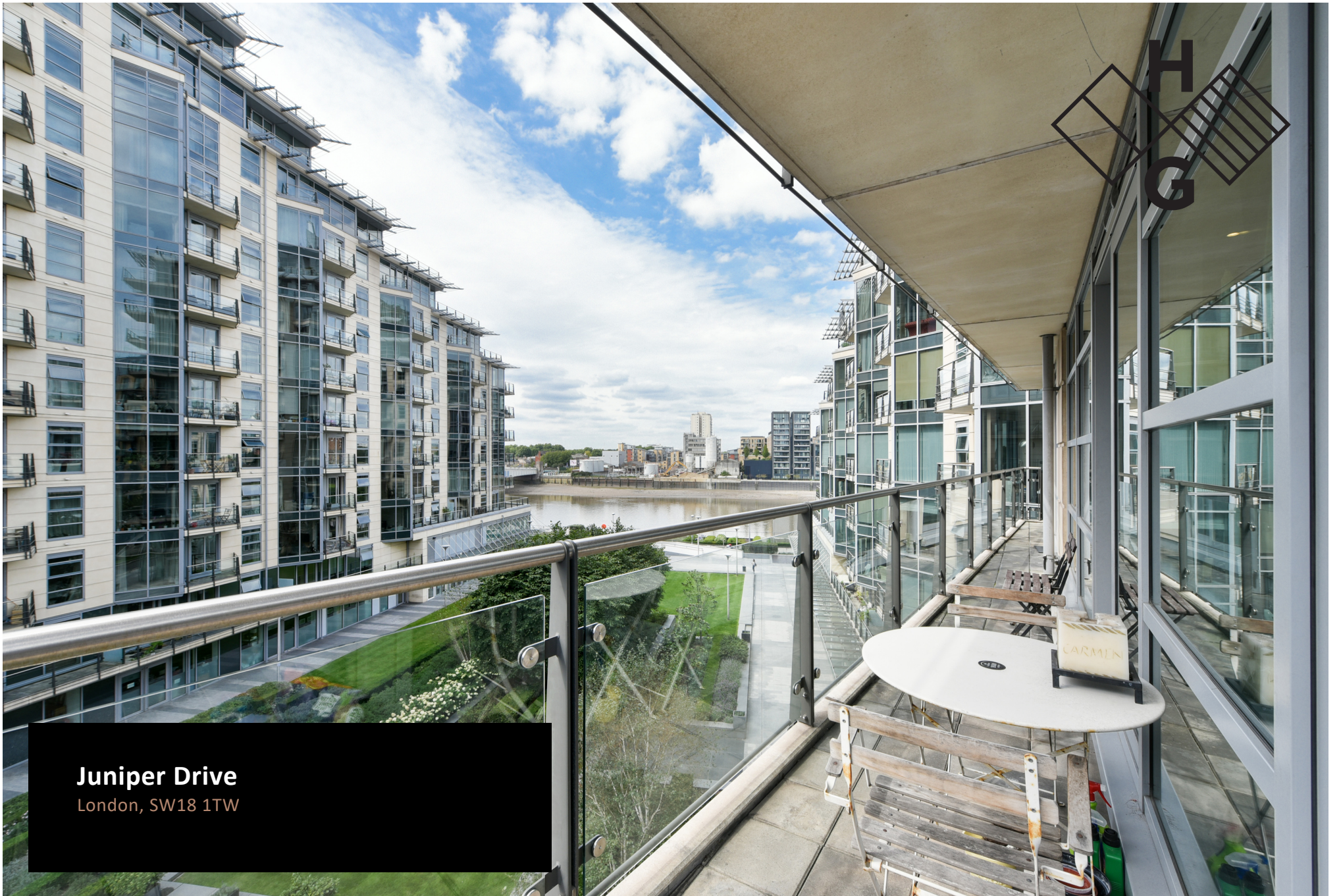
Juniper Drive London, SW18 1TW