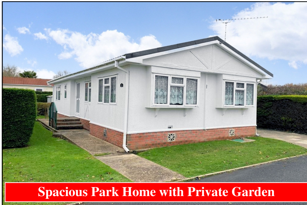
Spacious Park Home with Private Garden

32 Stour Park, New Road, Bournemouth, Dorset. BH10 7DE