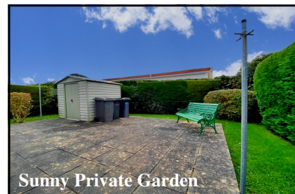
Sunny Private Garden