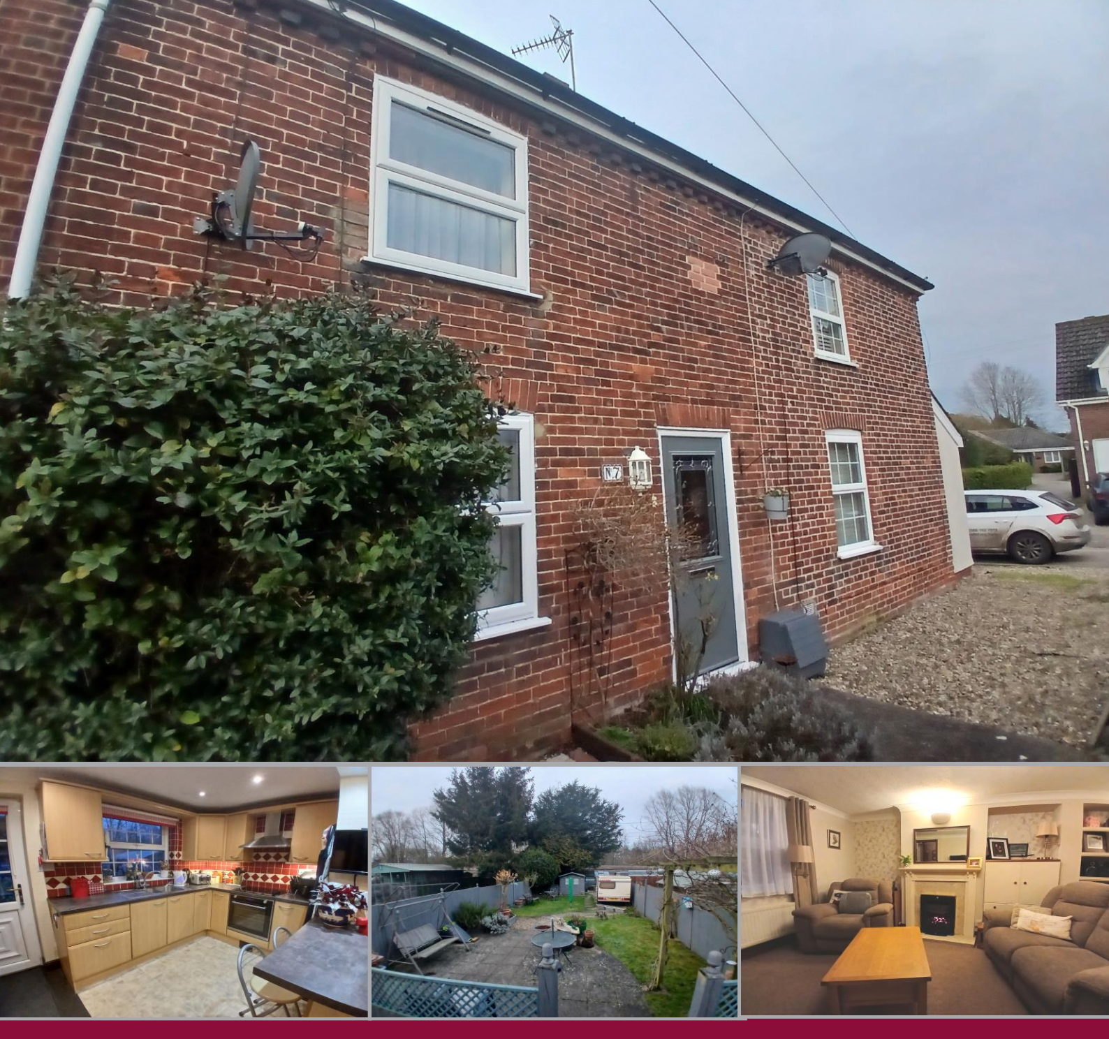
7 Freehold Road | Needham Market | Suffolk | IP6 8DU

Specialist marketing for | Barns | Cottages | Period Properties | Executive Homes | Town Houses | Village Homes