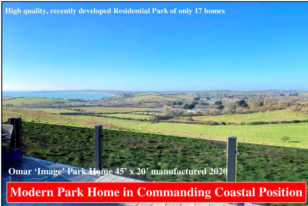
Omar 'Image' Park Home 45' x 20' manufactured 2020

High quality, recently developed Residential Park of only 17 homes