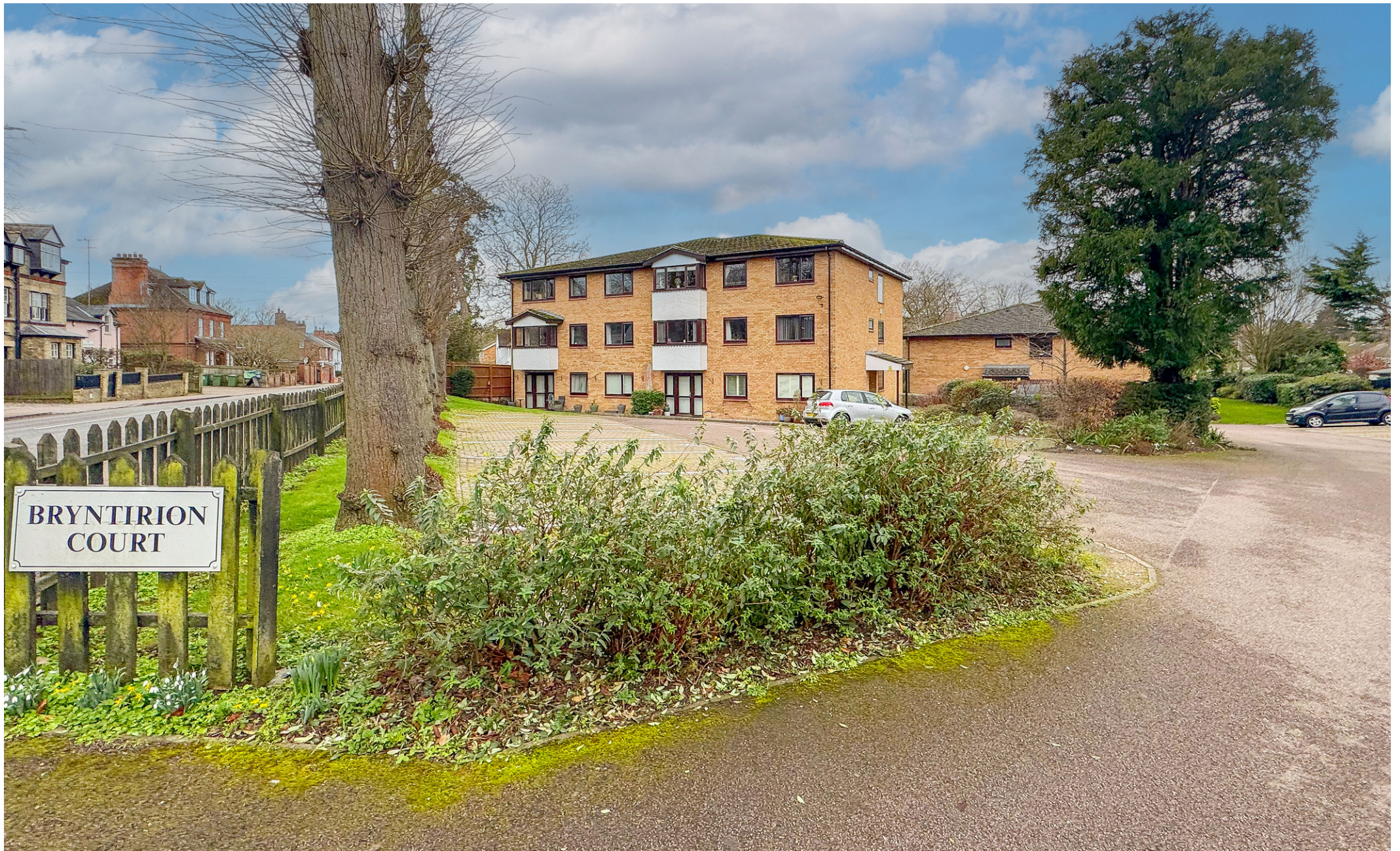
Bryntirion Court Newmarket Suffolk