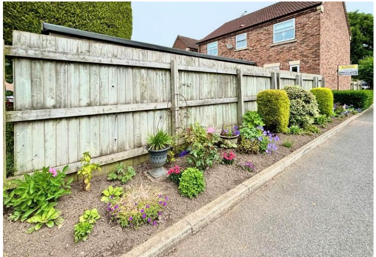
Entrance to development

Heating systems and other services have not been checked. All measurements are provided for guidance only. None of the statements contained in these particulars as to this property are to be relied upon as statements or representations of fact. In the event of a property being extended or altered from its original form, buyers must satisfy themselves that any planning regulation was adhered to as this information is seldom available to the agent. Floor plans are for illustrative purposes only.