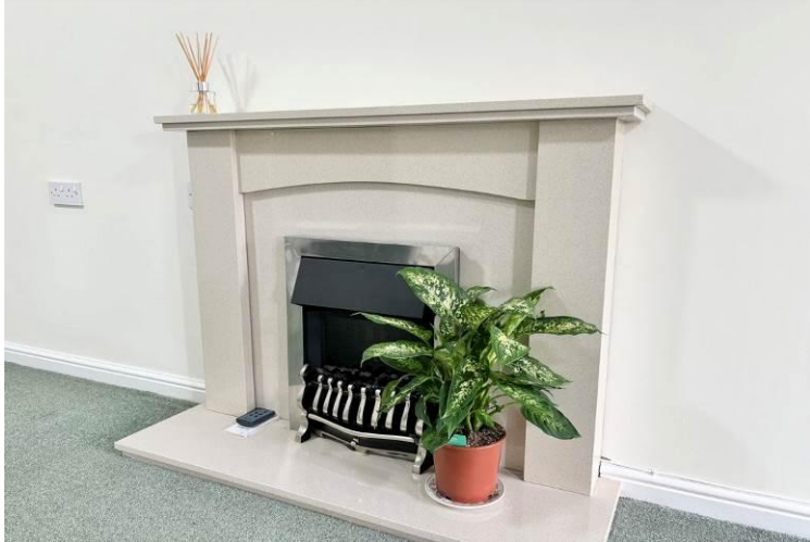
Fireplace in Lounge