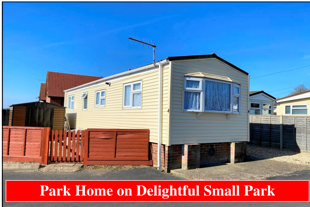
Park Home on Delightful Small Park

4 Ashley Wood Park, Tarrant Keyneston, Blandford, Dorset. DT11 9JJ