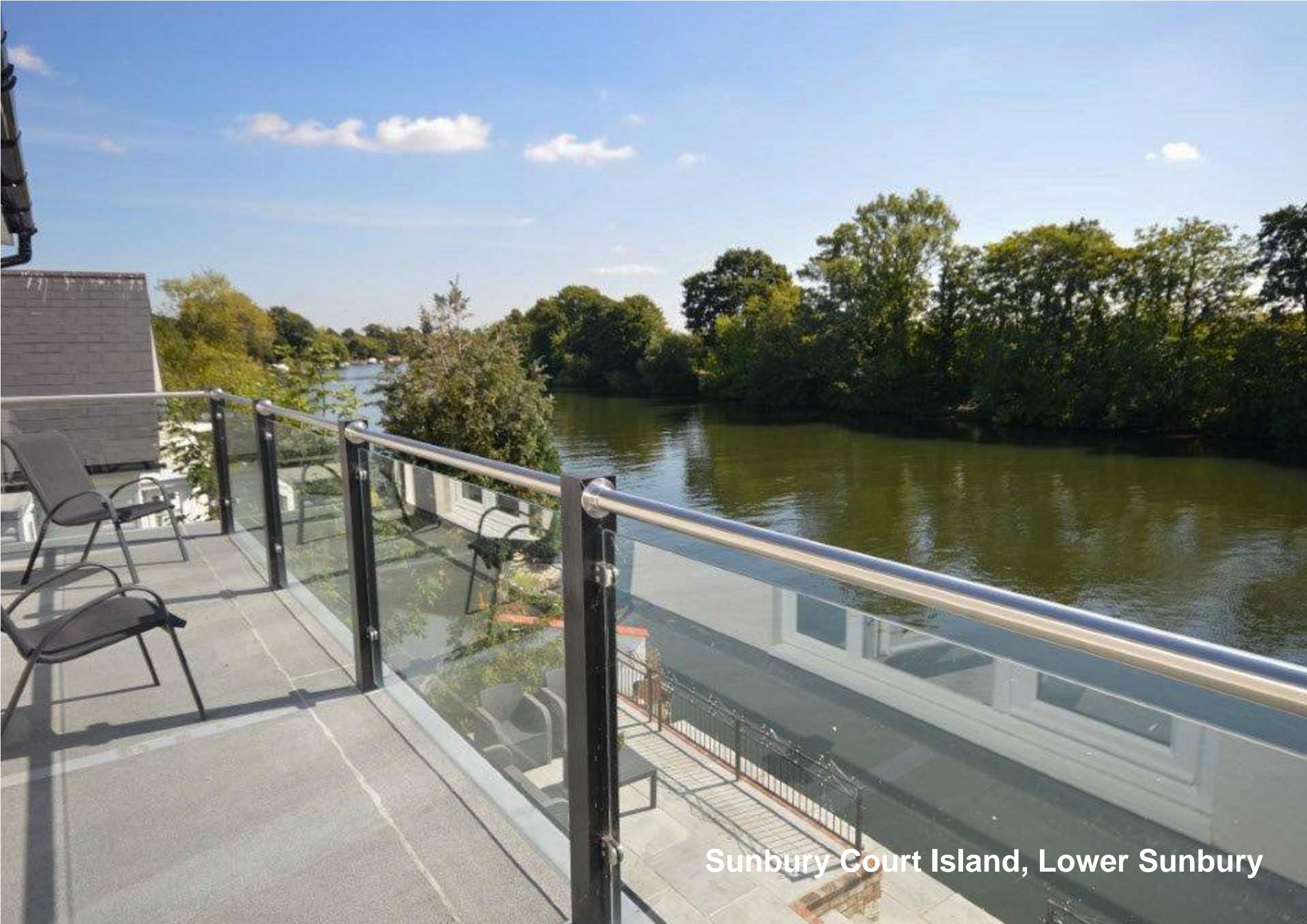
Sunbury Court Island, Lower Sunbury