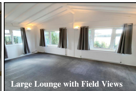
Large Lounge with Field Views