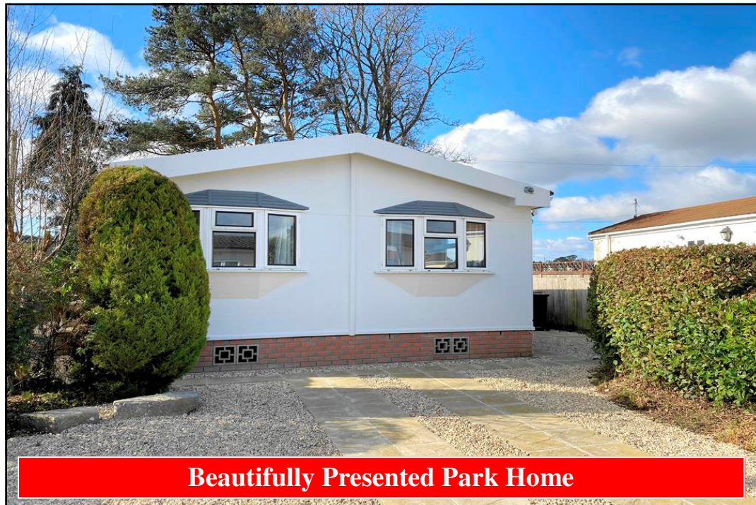
Beautifully Presented Park Home

12a Holton Heath Park, Wareham Road, Holton Heath, Poole. BH16 6JS