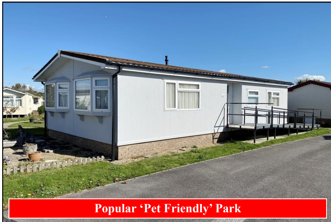
Popular 'Pet Friendly' Park

45a Selwood Park, Weymans Avenue, Kinson, Bournemouth. BH10 7JU