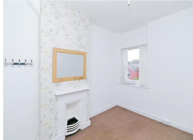
11' 6" x 9' max ( 3.51m x 2.74m max )