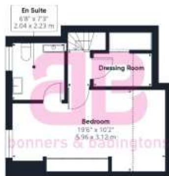
Floor 2 Building 1